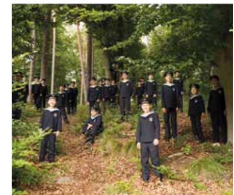
The "Vienna Boys Choir" in the park of Warmbad