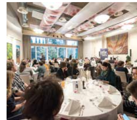
Crime Festival Carinthia