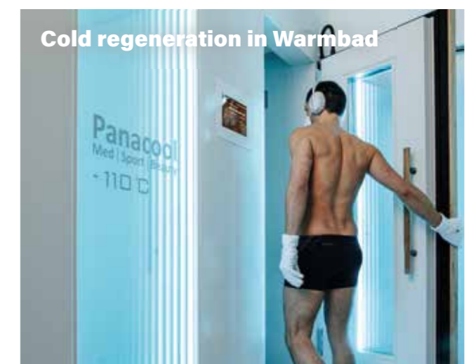
Cold regeneration in Warmbad